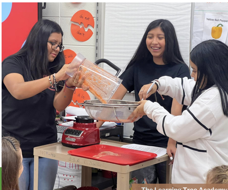
The Learning Tree Academy

Our mission is to engage Farm to School stakeholders by providing resources, professional development, and recognition programs to increase the awareness, access and consumption of locally grown food in school meals and beyond.