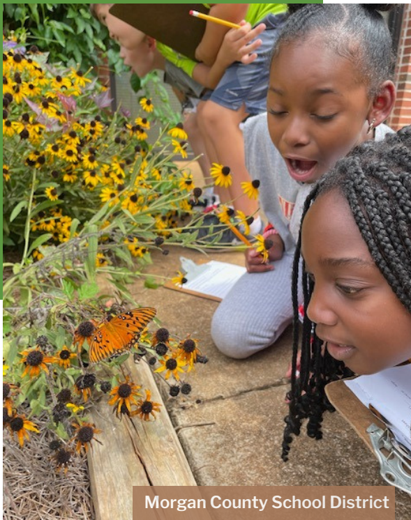
Morgan County School District