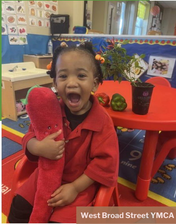
West Broad Street YMCA