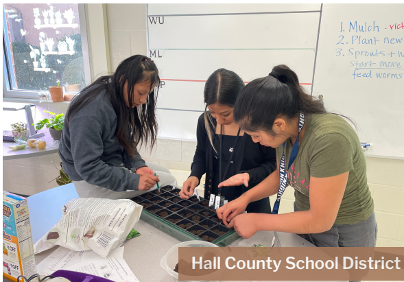
Hall County School District

“The Georgia Farm to School Alliance is a great way to stay connected with the work being done in Farm to School around the state and in our region, build connections, and access resources.”