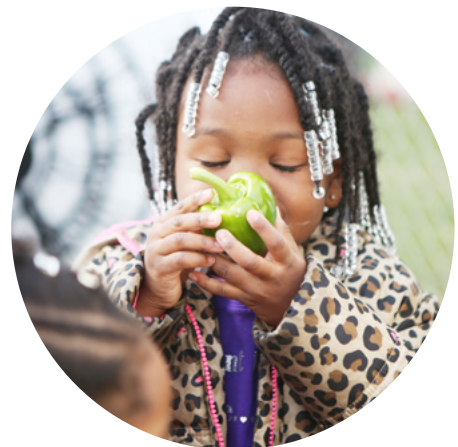
TEE TEE'S DAYCARE IN LOWNDES COUNTY