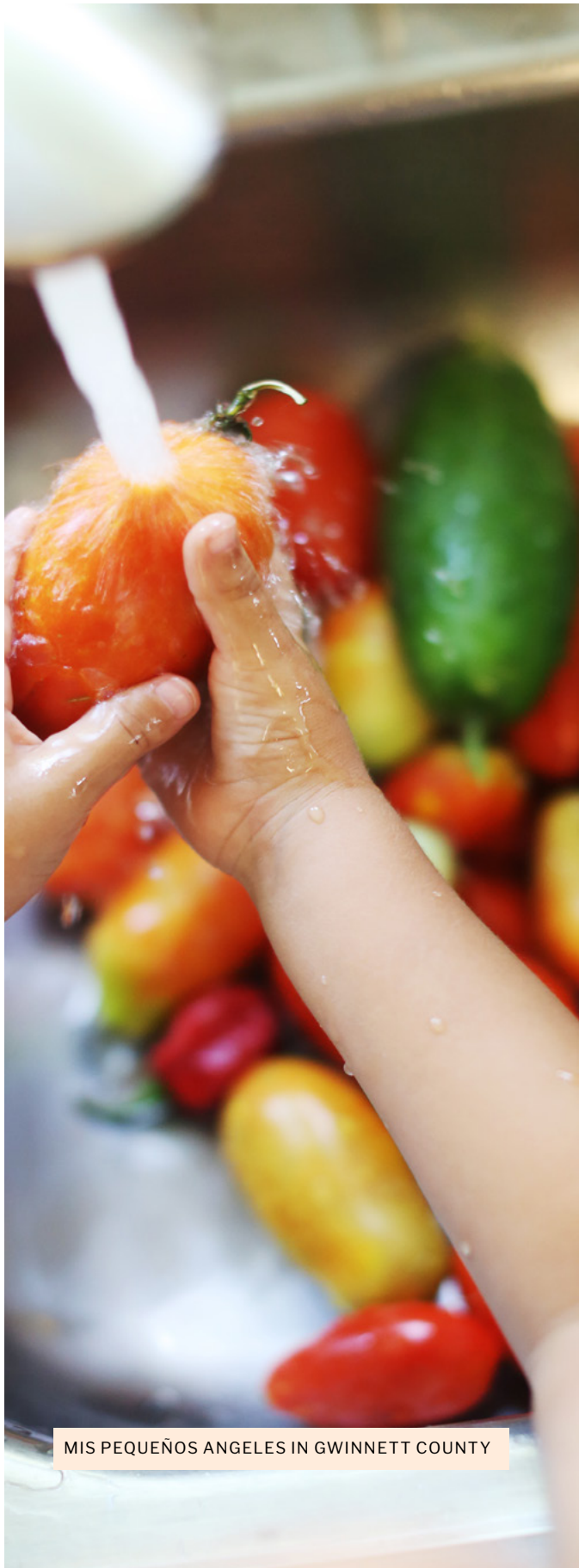
MIS PEQUEÑOS ANGELES IN GWINNETT COUNTY