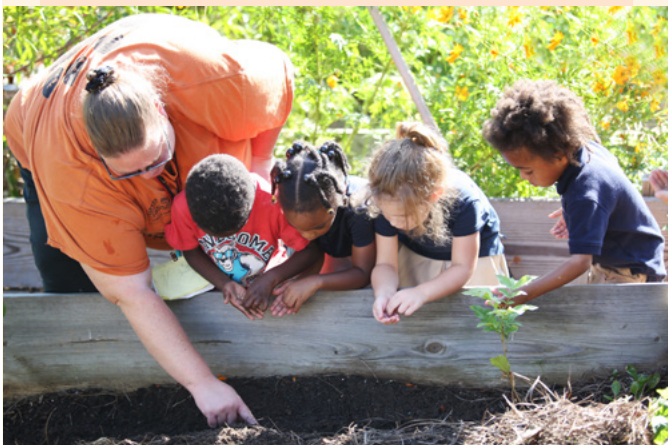
LITTLE ONE'S LEARNING CENTER IN CLAYTON COUNTY

Instead of hampering efforts, the COVID-19 pandemic inspired renewed investment among members to create equity focused plans that will increase access to fresh food, food education and community connections statewide.