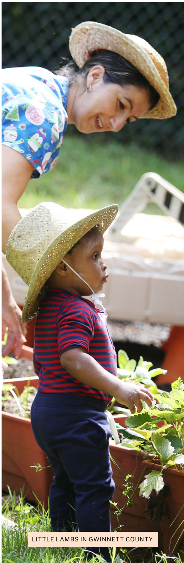
LITTLE LAMBS IN GWINNETT COUNTY