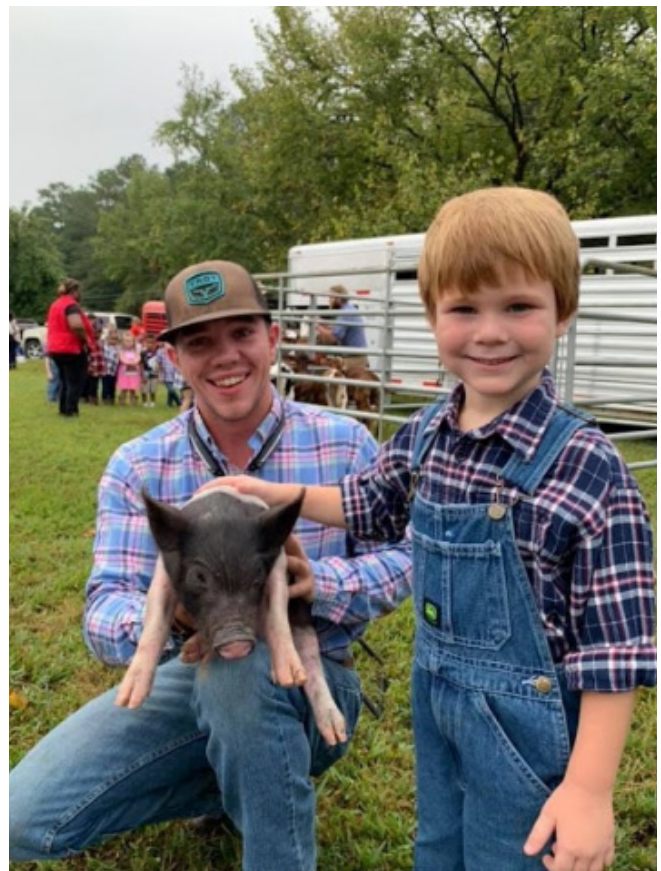
MORGAN COUNTY CHARTER SCHOOL SYSTEM